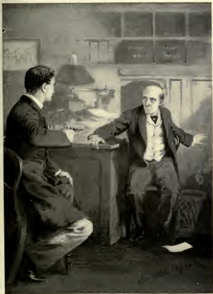
"WHEN YOU PRESS THE IVORY BUTTON, I FIRE."—Page 57.